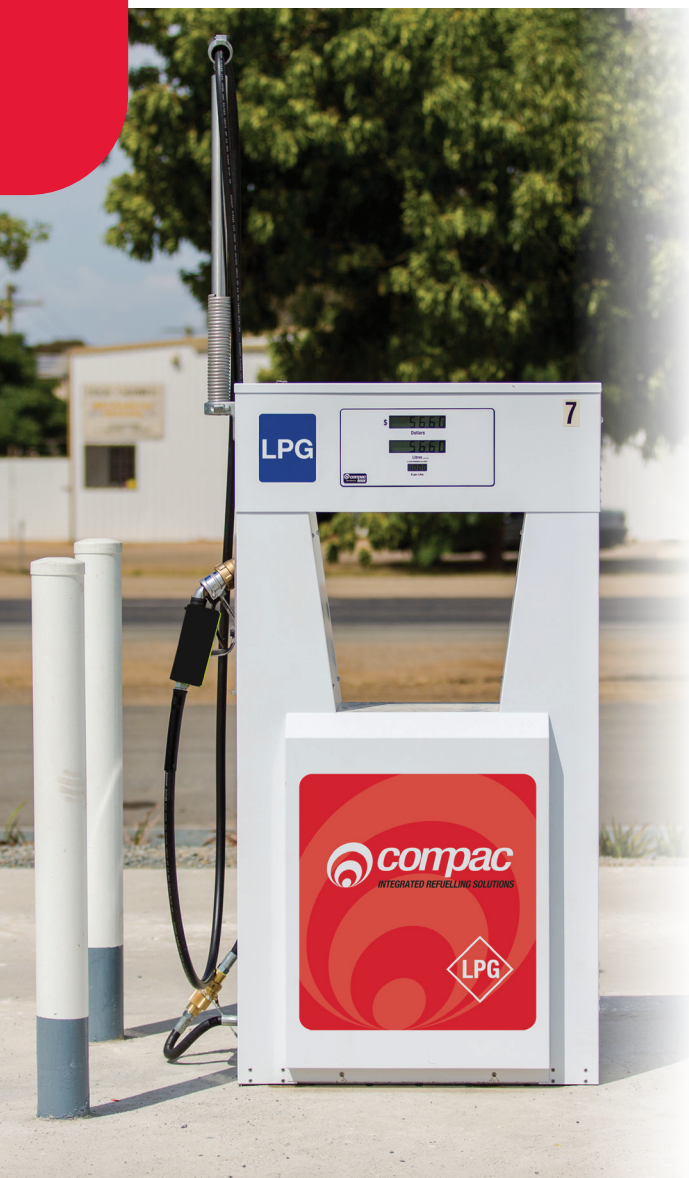
LPG Laser installed on site