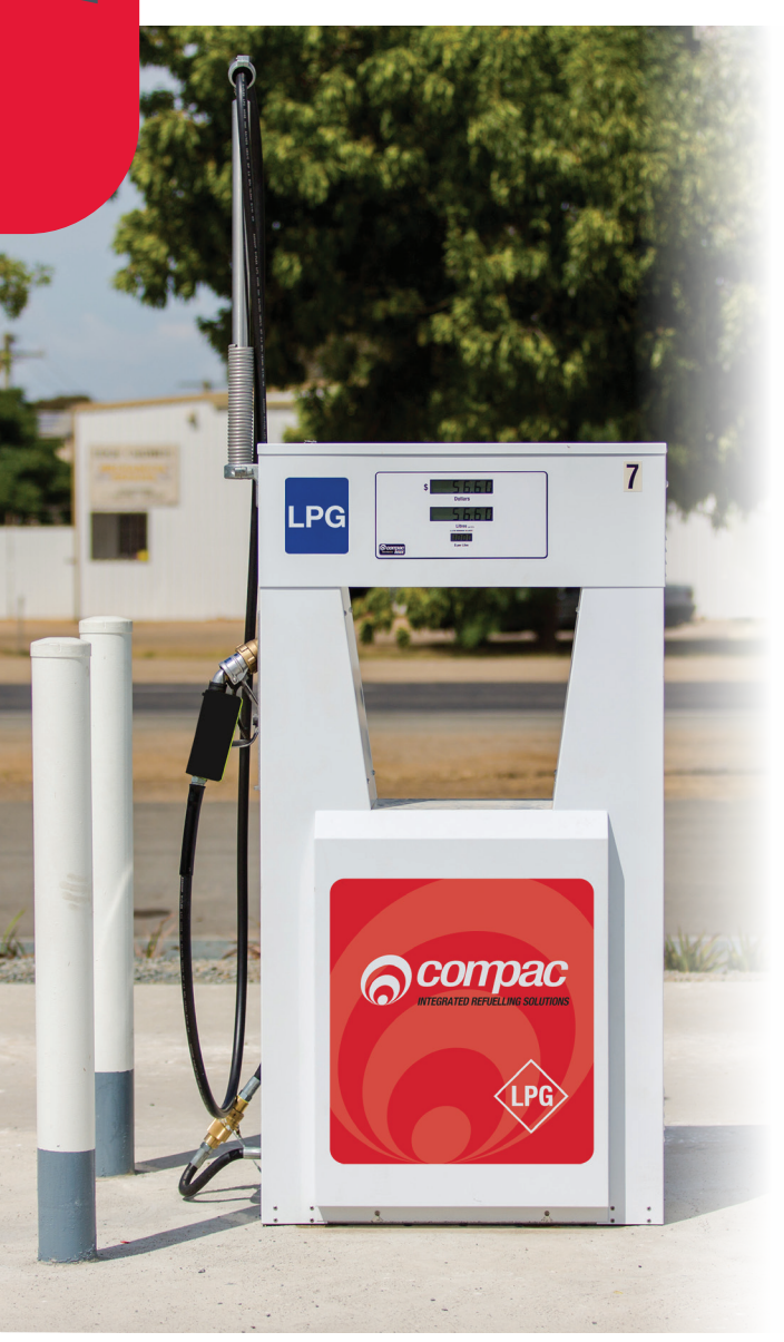
LPG Laser installed on site

The LPG Dispensers come complete with the Compac V50 Coriolis Mass Flow LPG Meter and the Compac C4000 Electronic Fuel Head.